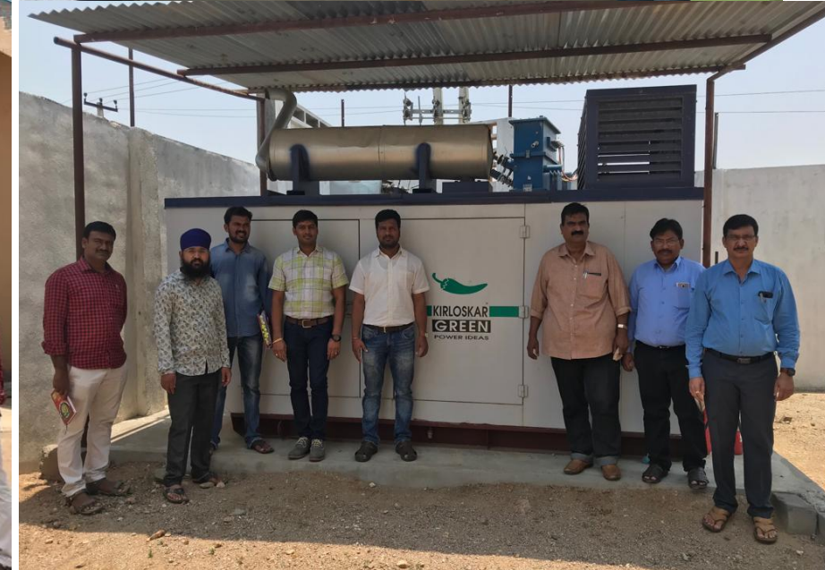
M/s. Veerabhadra Cold Storage, Gisukonda (V & M), Warangal (R) Dist